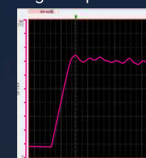
C-FILL mini P type

Precise temperature control Good performance give you the most smooth cutting of gutta-percha